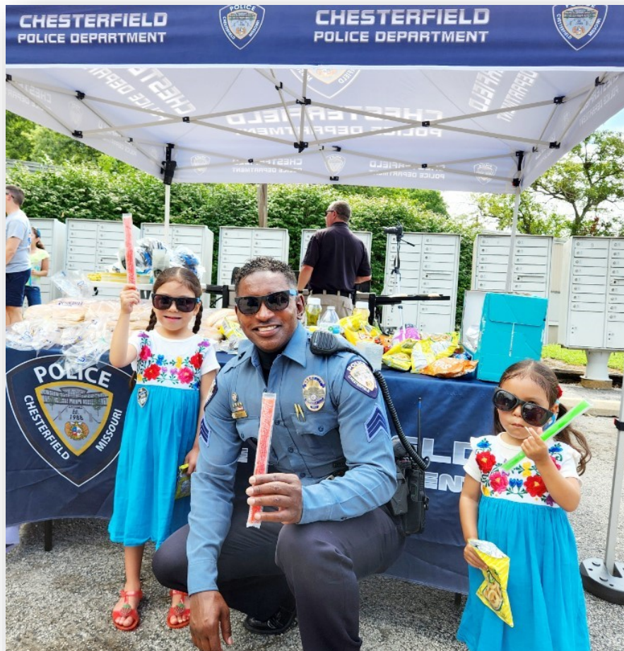
Community Affairs held a Summer Blast event at the Chesterfield Mobile Home Park.

17XXX North Outer 40- On 8/5/2023 a 30-year-old Illinois resident punched his 17-year-old stepdaughter in the abdomen twice with a closed fist while leaving the Main Event. The victim was released to her mother who was also on scene. The suspect was arrested for the assault. In-custody State warrant application resulted in one count of Child Abuse being issued. Bond was set at $30,000.