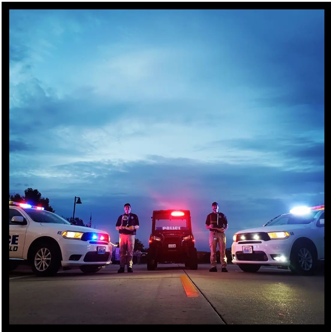
Two of our Volunteers In Police Service (VIPS) ready for action with Collection Boots at the Ed Nestor Memorial Backstoppalooza concert benefiting BackStoppers.